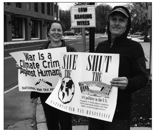
Vigil in front of TD Bank, an investor in pipelines, during the war tax resistance gathering in Amherst, Mass., November 4, 2017.