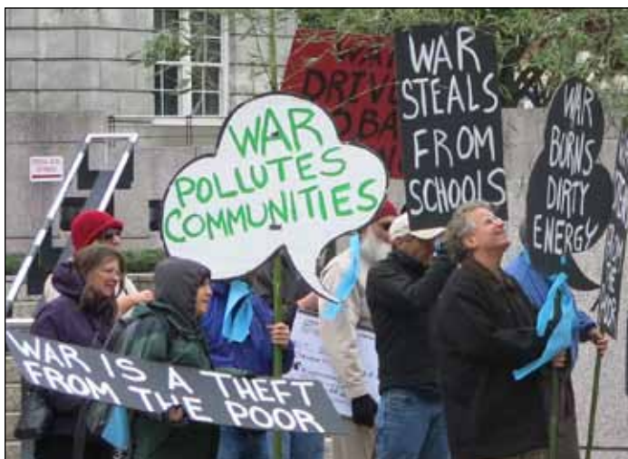
Signs with easy-to-read big letters and simple messages attract attention! Get yours ready for tax day now.

Probably like many of you I spend way too much time staring at my computer screen and being in touch with friends and the world “virtually.” So, our motto for tax day should be “off the computers and into the streets!” Besides making ourselves more visible, interacting with passers-by is usually enlightening. This year NWTRCC sponsored some pilot projects under the “Divest from the Pentagon” slogan, and activists tried to partner with new groups and plan events throughout the tax season. We’ll have reports on this at our