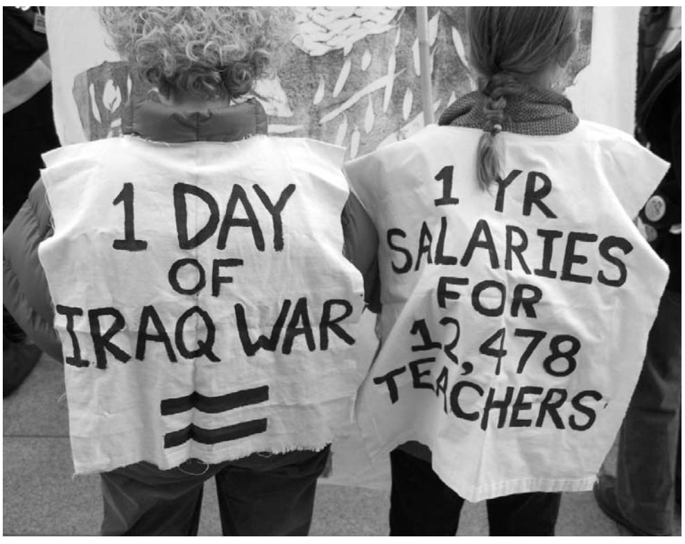
New York City, April 15, 2008.

He suggests that one month before going to war, give everyone in the country — bankers, CEOs, politicians, workers — the