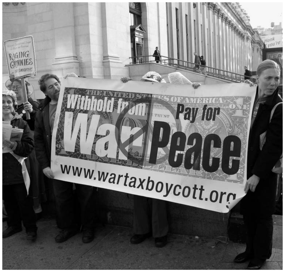
New York City, April 15, 2008.

Please contact the NWTRCC office with your comments about the 2008 War Tax Boycott and what you think should happen next: PO Box 150553, Brooklyn, NY 11215, nwtrccc@nwtrcc.org or1-800-269-7464. ▼