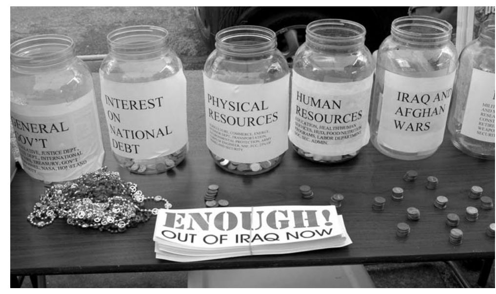
Attract people to your tables with a variety of items like a penny poll (instructions available from the NWTRCC office), bumperstickers, and peace symbol beads. Eugene Taxes for Peace Not War, April 2008.