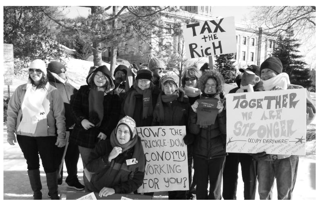
Members of Occupy Bangor (Maine) enjoy their new "Foreclose on war, invest in people" scarves, compliments of NWTRCC, after their General Assembly in downtown Bangor. Thanks to the generosity of NWTRCC donors we were able to send about 200 scarves to occupiers around the country.