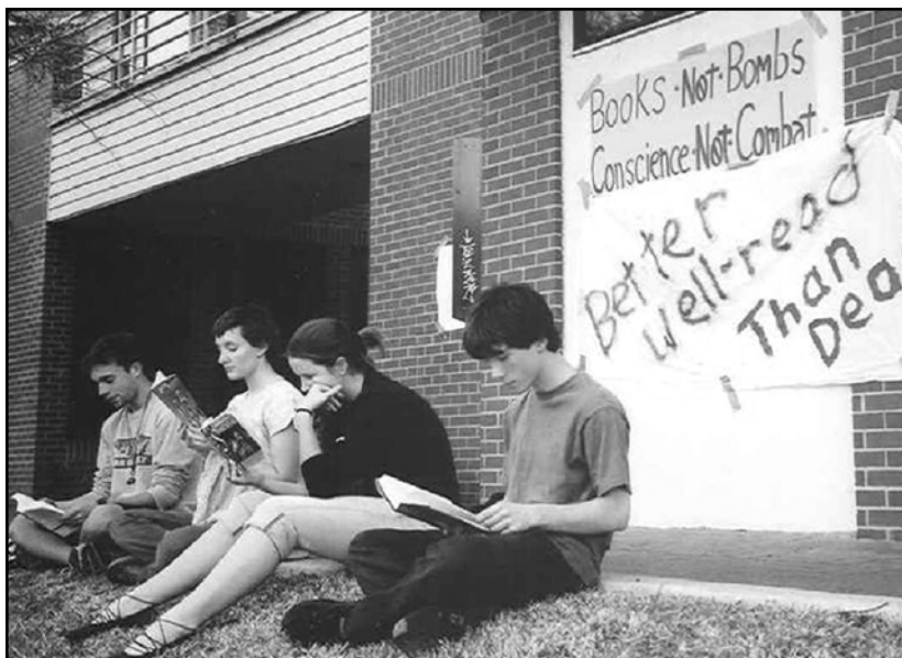
Youth activists of Austin demonstrate in front of school district headquarters

SVH: I also see a lot of hope in the counter-recruitment movement, with students saying "no," and I wondered if you also feel hopefulness about this.