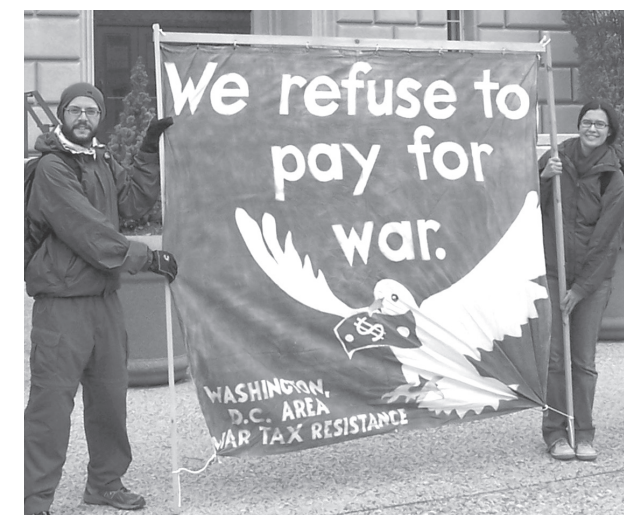
Tax day at IRS Headauarters.

Often people are concerned that by not paying federal taxes they are also withdrawing their support from the "good parts" of the U.S. budget. The government does not allow you to designate the purpose for which your tax money is used, so a percentage of whatever you pay will be used for military expenditures. Many resisters pay state and local