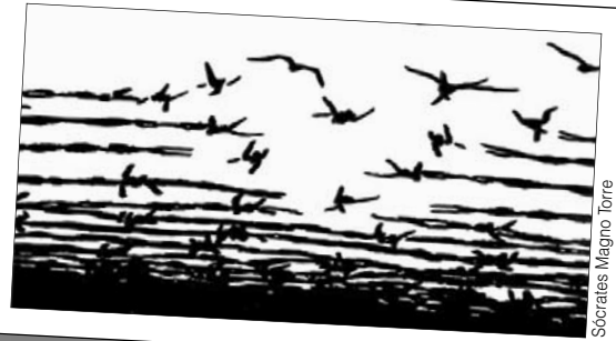
Socrates Maigno Torre

... you want a WORLD WITHOUT BORDERS , while your taxes are building walls?