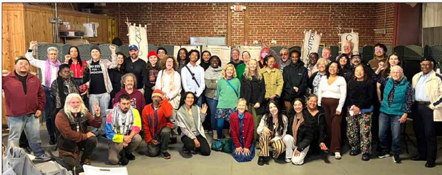
Group photo of granting ceremony for People's Life Fund of Northern California.