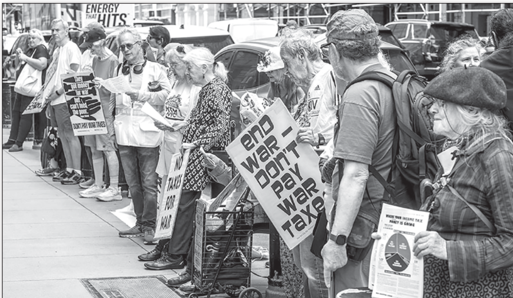
Tax Day in Manhattan.