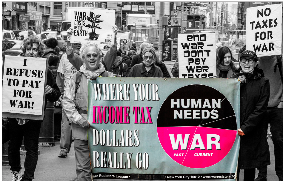
Tax day protesters marching in Manhattan.

Brattleboro, Vermont – On Tax Day members of Taxes for Peace New England tabled at the Brattleboro Food Co-op (10am-5pm). We gave out cookies, talked with people about war tax resistance, and shared that NWTRCC is a great resource for more information and assistance. A lot of people were supportive and, unre-