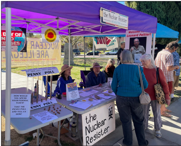
Nuclear Resister Tabling in February 2025.