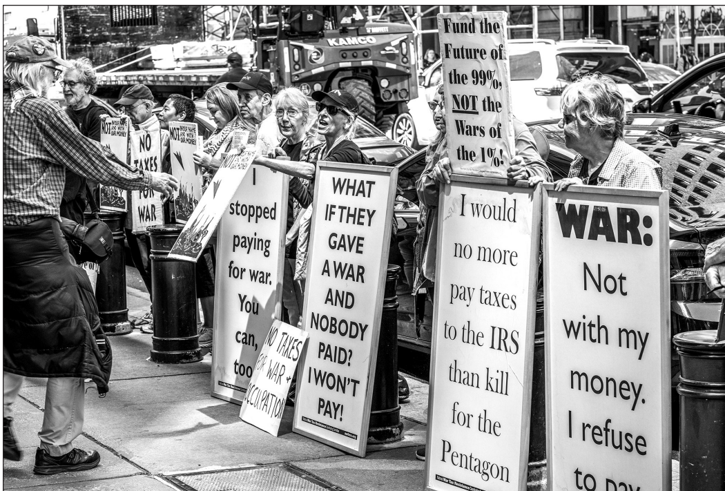
Tax Day 2024 Protest in Manhattan.