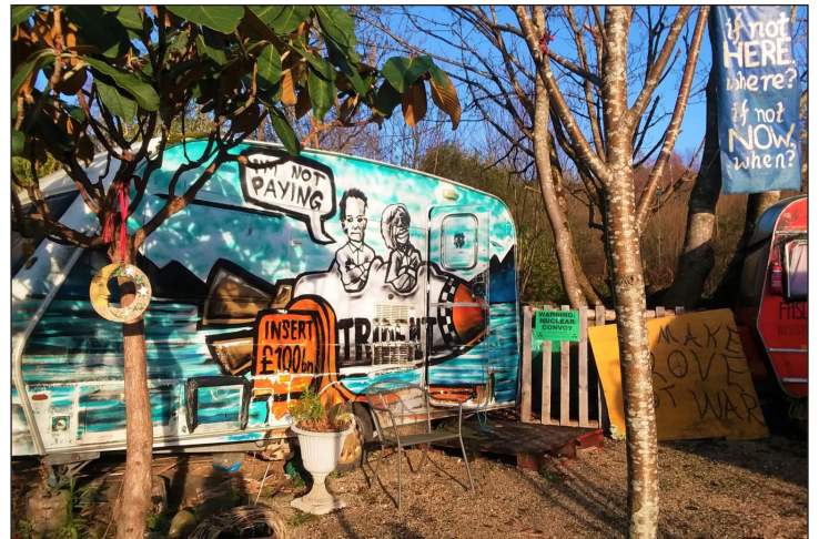
Faslane Peace Camp.

One of my favorite pieces was a list, I think in the 2000 issue, of all the arrests at Faslane in 1999. This list featured such gems as the arrest of a person called Fungus on November 13 at a Ploughshares action, “for being a pain in the arse’ near the Faslane fence.” Teapot was arrested “for snogging a police van” at a Ploughshares action on August 24. There were many more serious entries on the list too—climbing fences, cutting