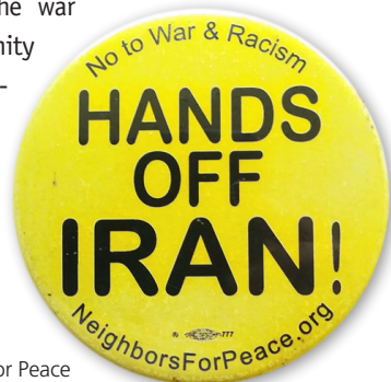
Revived Button from Neighbors for Peace in Chicago.