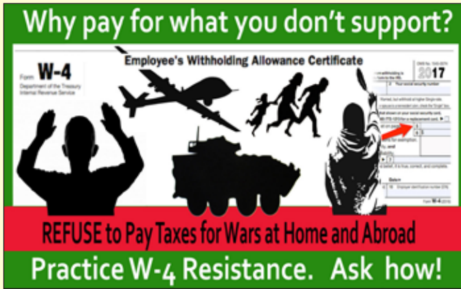
Northern California WTR promoted W-4 resistance with this graphic on a flyer and banner during the tax march in San Francisco, April 15, 2017.

For 2018, the IRS has adjusted withholding allowances in a way that suggests individuals do not have to change their W-4; withholding should look about the same as in 2017. Employers are to begin making withholding adjustments now, so monitor your paystubs to see what is being withheld and ask to change your W-4 as needed. NWTRCC has a formula in Practical #1 and on the flyer that can help you calculate allowances. Publication 15, Employer's Tax Guide from the IRS is being updated now and will include handy charts to help you figure your allowances also.