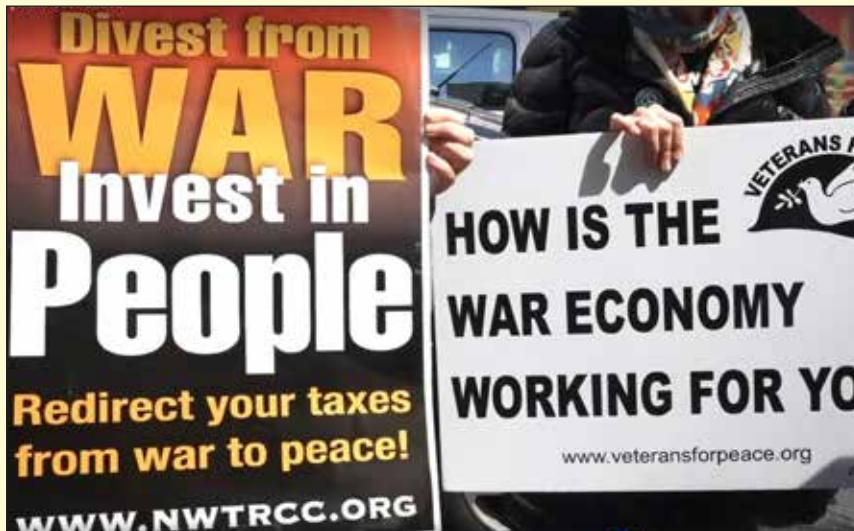
Outside the IRS in New York City, Tax day 2017.