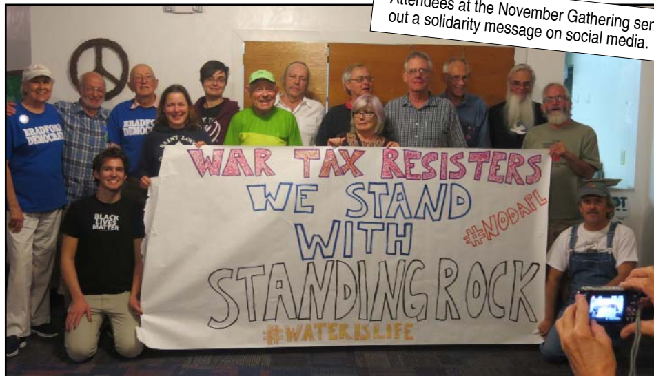
Attendees at the November Gathering sent out a solidarity message on social media.