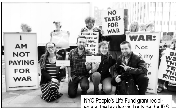
NYC People's Life Fund grant recipients at the tax day vigil outside the IRS.