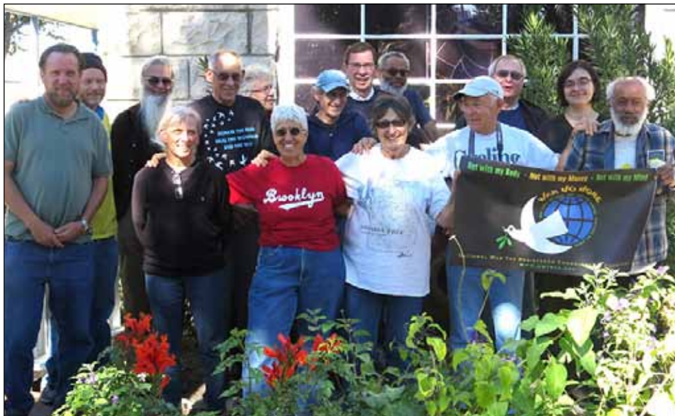
Las Vegas WTR Gathering, November 8, 2015.

organizational handbook and support for pilot projects this tax season. The group did not pass a proposed new logo. A committee formed to develop a WTR comic book proposal with specific ideas for the May meeting, and the group endorsed Campaign Nonviolence, a coalition of peace and justice groups sponsoring nationwide conferences and actions.