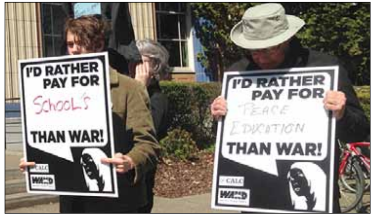
Signs on tax day in Eugene, Oregon.

Is the next step to resist paying our debt? Maybe, although there are some ways to get out of debt, such as working for a nonprofit (approved