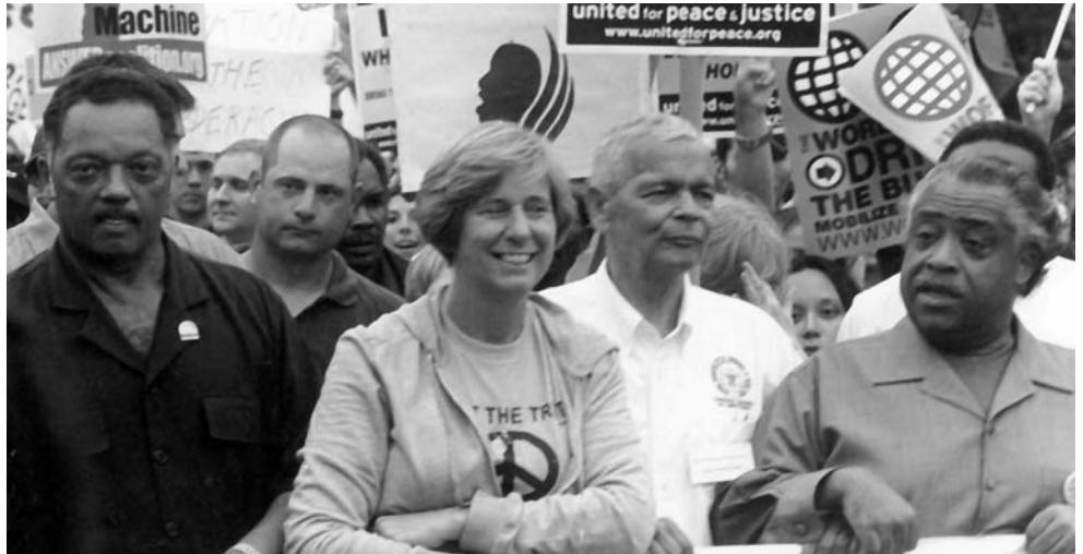
Cindy Sheehan with Jesse Jackson, Julian Bond, and Rev. Al Sharpton at the front of a march to “Bring the Troops Home” Now in Washington, DC, 2005.