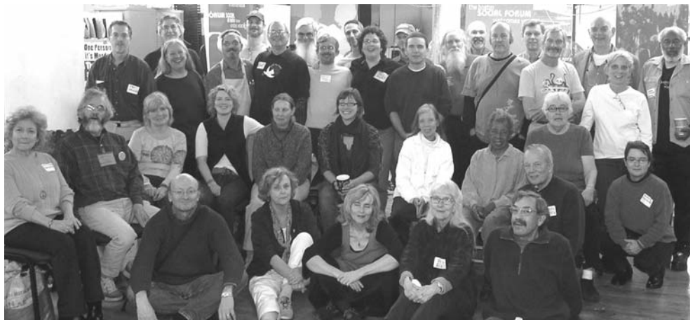
There were still 36 of us at the Sunday sessions of the combined New England and NWTRCC Gatherings in Boston November 5-7. More than 60 people attended the Saturday sessions. See page 6 for a report from the Coordinating Committee meeting. We’ll have more reports from workshops in future issues.