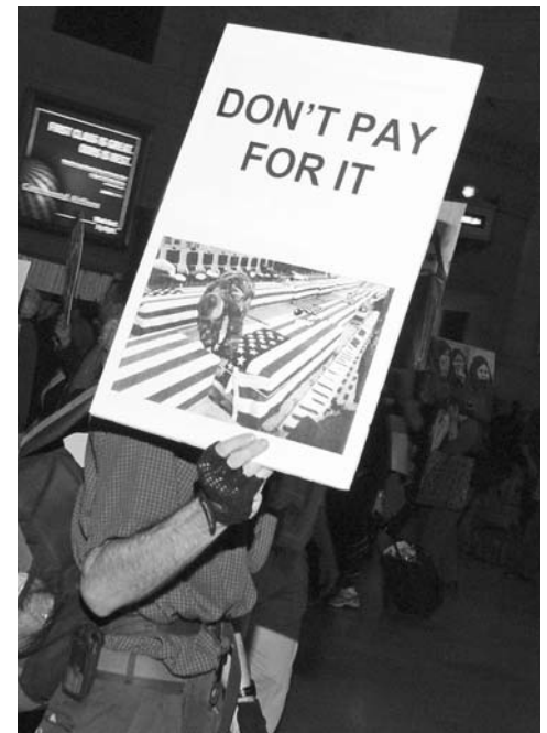
Grand Central Station, October 7, 2009.