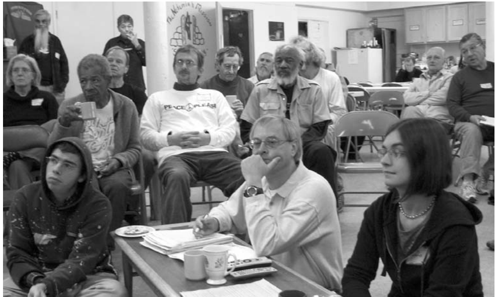
The group prepares to watch a preview of Death and Taxes.