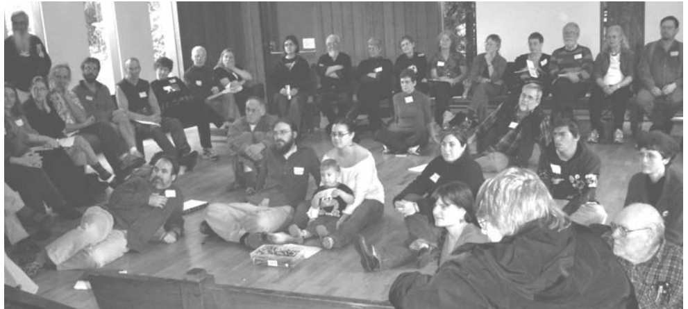
The group watches video clips from the coming war tax resistance film.

NWTRCC at the United for Peace and Justice Assembly in Chicago in December where much of the discussion will be about peace and justice activism in the Obama era. We committed to arranging strategy sessions with peace groups who have shown some interest in war tax resistance to help guide our work.