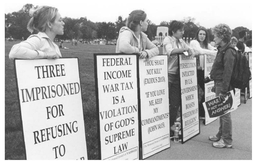
Members of Restored Israel of Yahweh at a DC antiwar demonstration in September 2005.

fines and penalties that they paid after their convictions In addition there is the open question of how the government will respond if the defendants choose to continue to refuse to pay for war and not honor the court order to file and pay all delinquent taxes and pay back taxes. \checkmark