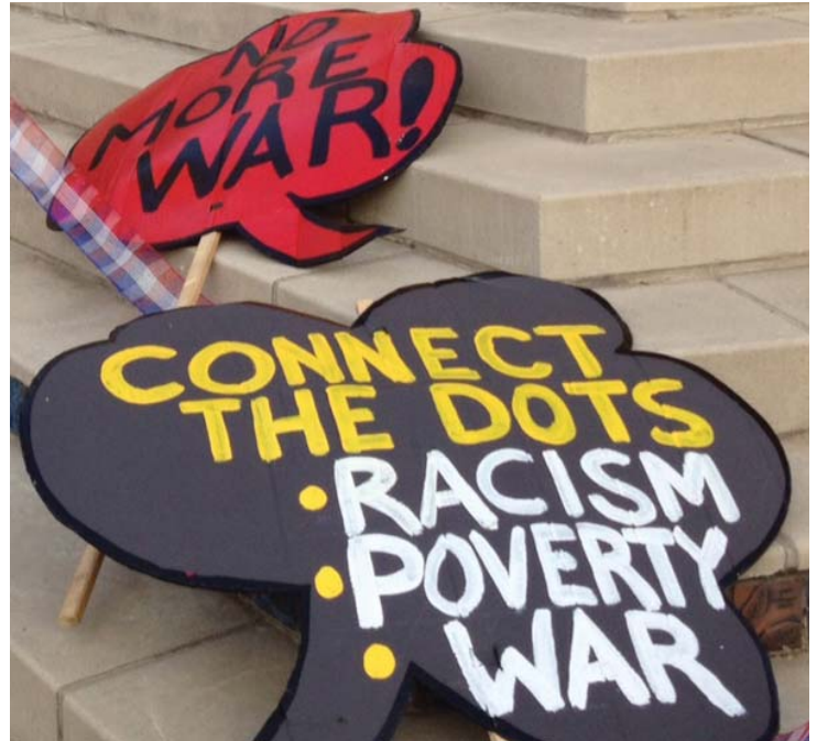
New South Network of War Resisters signs at the Impact to Mountain Moral Monday gathering in Asheville.

I want to say two things about this issue: yes, the police are milita-