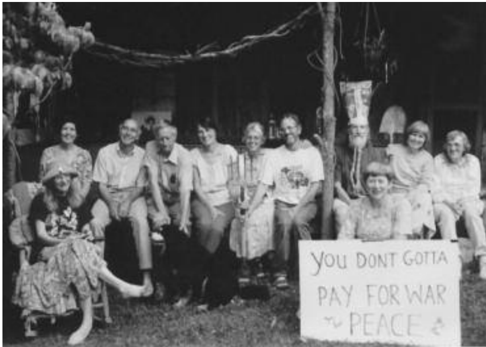
Asheville area war tax resisters and peace taxpayers gathered in Celo, North Carolina, in 2004. Join them in January for the first Southeast gathering of war tax resisters in many years.