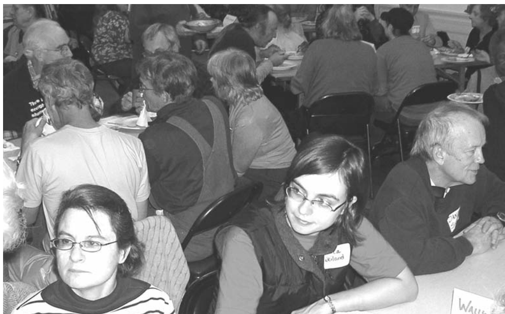
Expect good food at war tax resistance gatherings, and meals are an excellent time to share stories with other resisters.

Would that we could stand before the Congress in Washington and plead for them to get off this train .