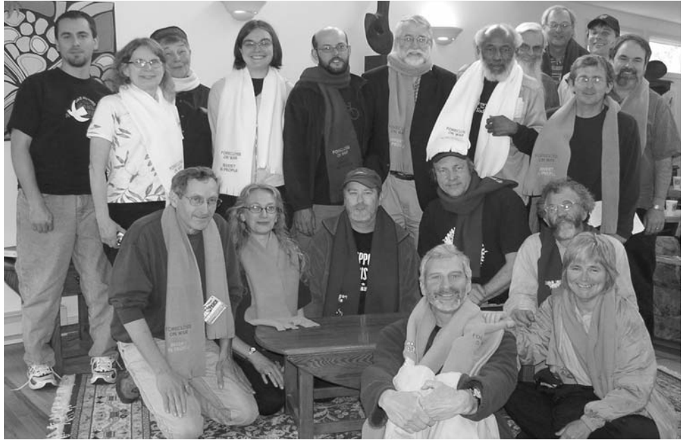
The gang at the end of the Coordinating Committee meeting in Harrisonburg, VA, May 2009. We're modeling the "Foreclose on War, Invest in Poeples" scarves that NWTRCC will be selling again this fall as a fundraiser. Of course, you can order before the cold weather sets in. $15 each plus $1.73 postage. See nwtrcc.org/scarves.htm for details or call the office at 1-800-269-7464.