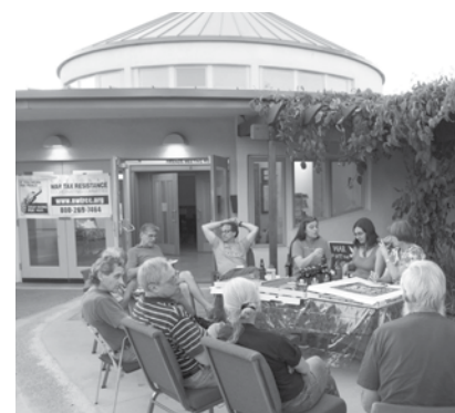
ABOVE: Pizza on the plaza at the Friends Center.