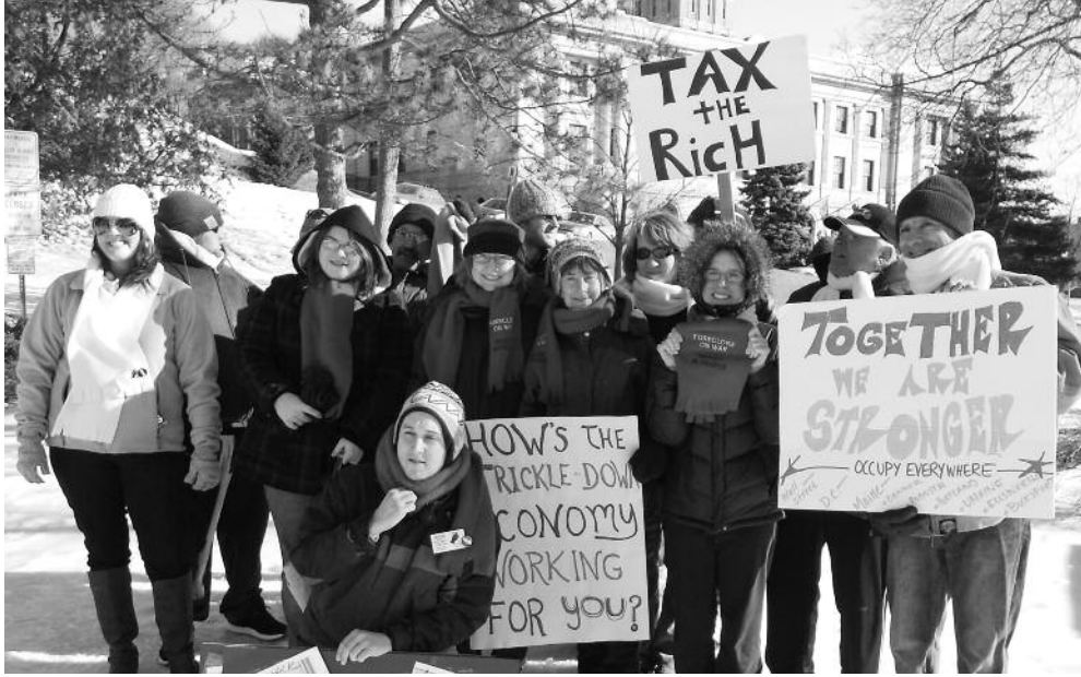
Members of Occupy Bangor (Maine) enjoy their new “Foreclose on war, invest in people” scarves, compliments of NWTRCC, after their General Assembly in downtown Bangor. Thanks to the generosity of NWTRCC donors we were able to send about 200 scarves to occupiers around the country.