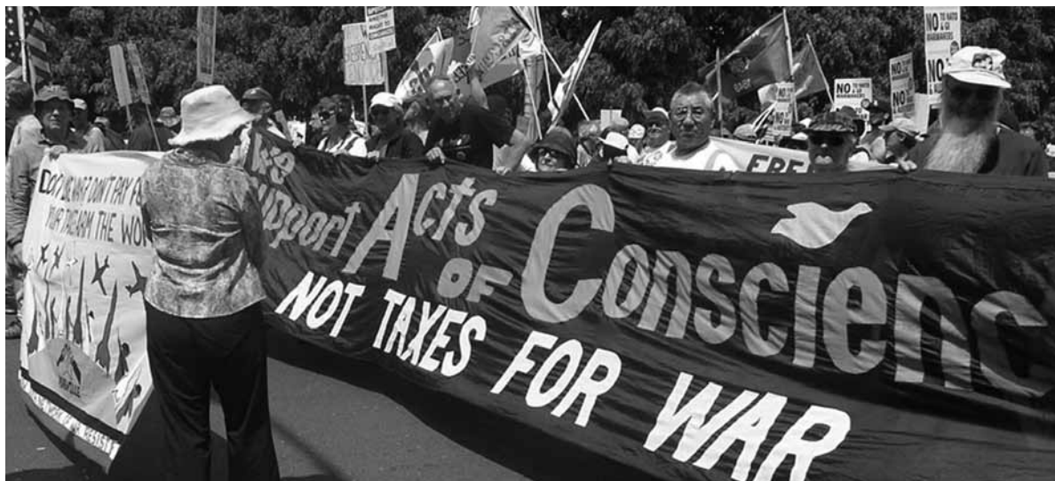
Nationally we joined thousands of activists to protest war, militarism, and the NATO summit held in Chicago in May 2012.

on War Tax Resistance and Peace Tax Campaigns that began in 1985 and has met every second year since. War tax resisters can feel very isolated, so at each of our gatherings we send cards to people who are facing IRS action or struggling as low income resisters. In this “wired world” people can find information on our website and may not seek out a local group. “Revitalizing local affiliates” is an ongoing priority for which your help is needed.