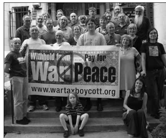
Chicago, May 2012, after the NWTRCC meetings.

Maine War Tax Funds for Life. The CC is carefully managing the 2011 grant from Craigslist Charitable Fund. The organization would not be here today without the generous support of many individuals, whether the donation is $1 or into the thousands, and the Fundraising Committee continues to brainstorm ideas to expand our funding base.