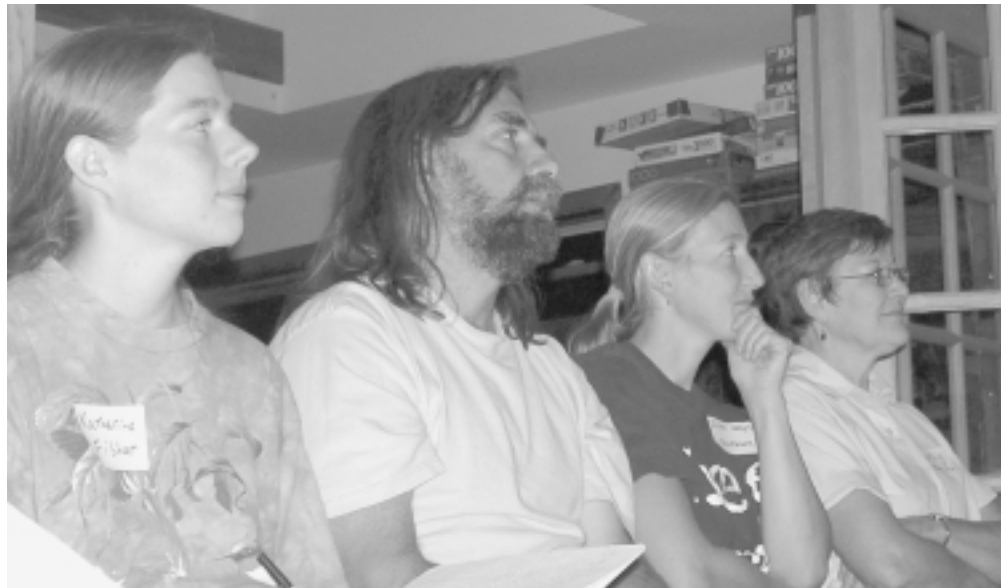
Intent listeners at the 2005 New England Gathering.