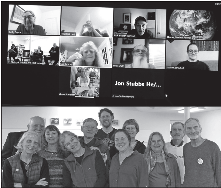
Group photo of the in-person and online participants at NWTRCC's Sunday business meeting.