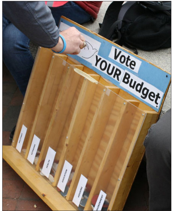
Boston Penny Poll on Tax Day 2018.

At NWTRCC’s business meeting at the beginning of November, we passed our annual budget for 2023. This budget anticipates taking about $12,000 from our reserves during 2023. Thankfully, because of generous donations earlier in the 2022, we do not anticipate needing to dip into our reserves this year as long as donations in December mirror previous years.