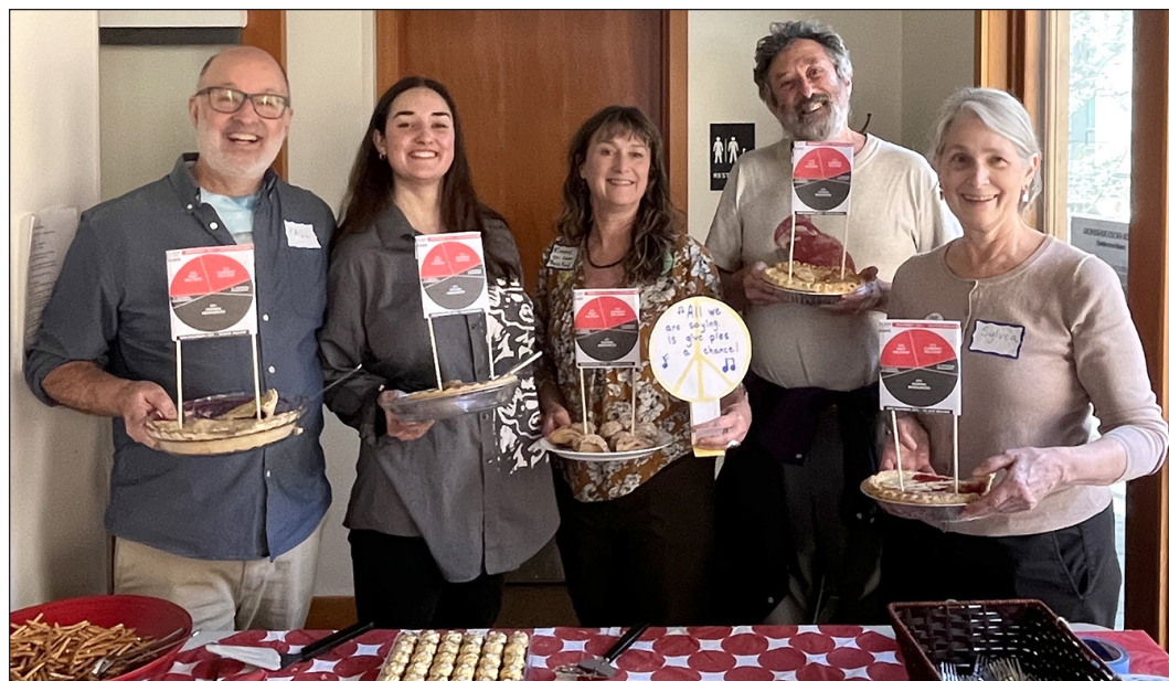
A WTR gathering in Portland, Oregon celebrates pies for peace.