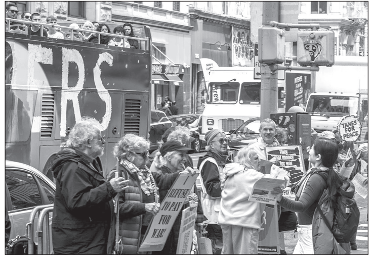
In Manhattan, protesters leaflet to a passing tourist bus.