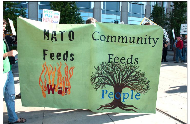
Image of NATO protest in Chicago.

While some may have notions of U.S. exports being McDonalds and Levis, the number 1 export of the U.S. has long been weapons. Now it appears as if we are attempting to convince our allies to adopt the McDonaldization of our militaries and create standard systems, munitions, and fuels. The only country to use nuclear weapons is calling for new standardization and efficiencies of delivering death.