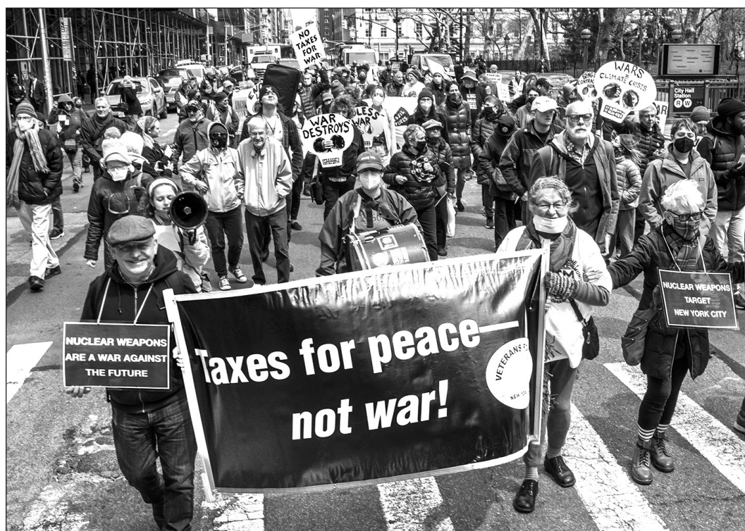
Tax Day Protesters in Manhattan marching down Broadway from the IRS office to Wall Street.