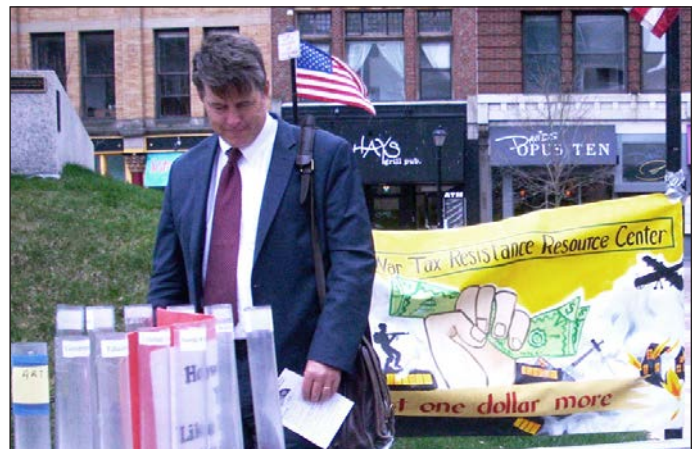
A penny poll and leafleting were held on Tax Day in downtown Portland, Maine, sponsored by the Maine WTR Resource Center. More than a dozen communities in Maine along with some college campuses hosted tables and leafleting from late March through Tax Day. The effort was coordinated by the Resource Center.

Border Convergence, School of the Americas Watch , November 10-12, in ambos Nogales at the militarized U.S./Mexico border. NWTRCC expects to have an active presence there. Please let us know if you plan to attend. soaw.org