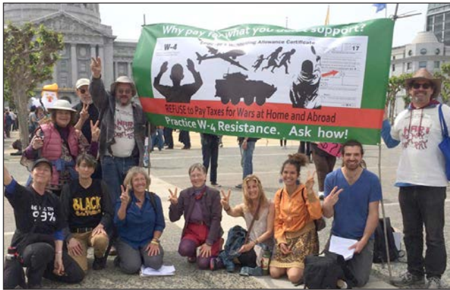
Northern California War Tax Resistance with their banner promoting W-4 resistance. They marched in the April 15 Tax March-San Francisco.