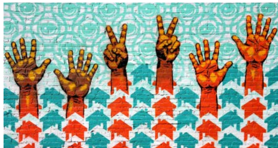
"Hands Up for Peace" mural in St. Louis. March 2015.

If you are traveling to St. Louis, there is public transportation from the airport and Amtrak or bus stations to the meeting site. Floor space for sleeping is available at the Friends Meetinghouse where there are also showers, and there will be some home hospitality too. NWTRCC's business meeting is