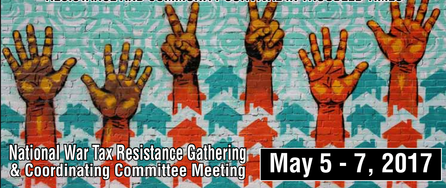
"Hands Up for Peace" mural in St. Louis.

RESISTANCE AND COMMUNITY SURVIVAL IN TROUBLED TIMES